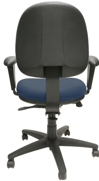
Atherton task chair