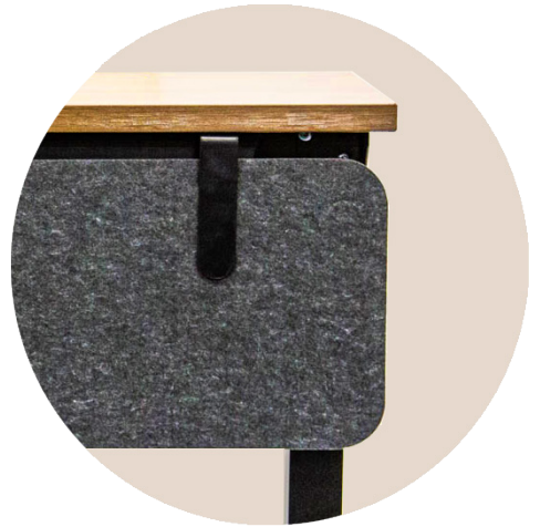
Modesty Panels PET material in dark gray felt

Modesty Panel width matches table width.