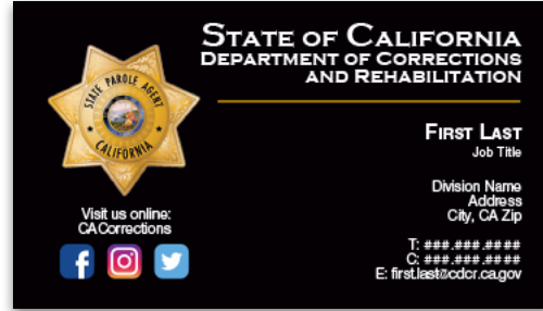
Parole Agent Business Card