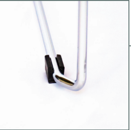
Floor protecting leg glides Ganging glides also available