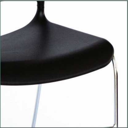
Waterfall seat edge prevents fatigue and provides support