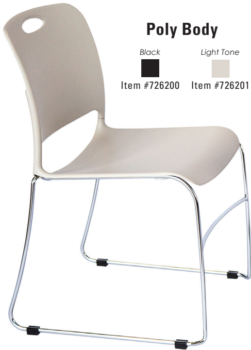
Poly Body Black Light Tone Item #726200 Item #726201

With Strata simple becomes smart and stylish. This multipurpose chair is ideal guest seating for cafeterias, auditoriums, reception areas, and more. The armless design with subtle curves offers superior comfort while maintaining a sleek silhouette