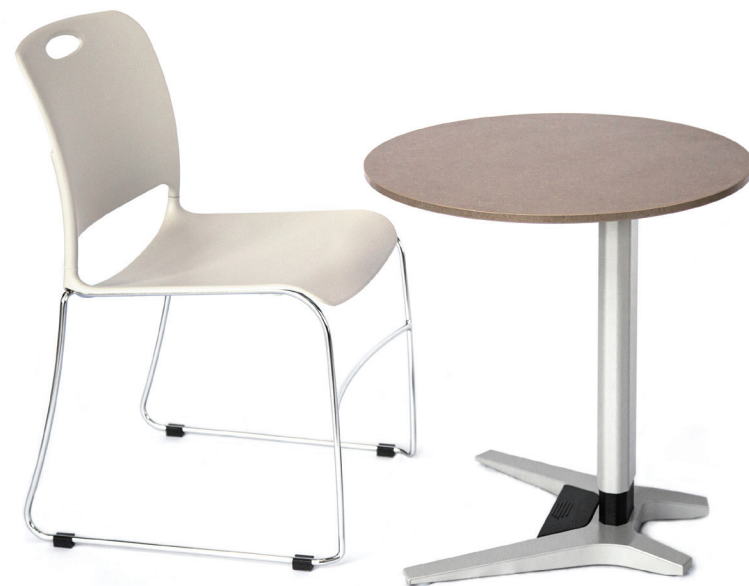
Shown with Round Top Elevate Table Item #713500