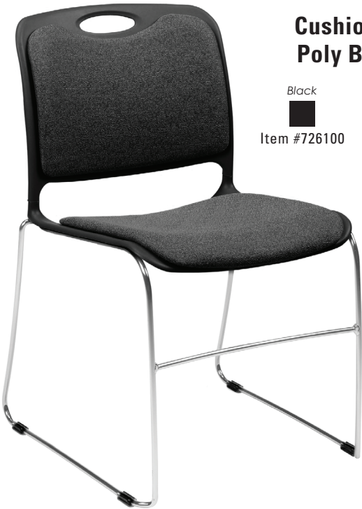
Cushioned Poly Body Black Light Tone Item #726100 Item #726101