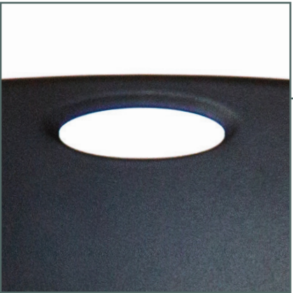
Integrated, contoured handle for easy mobility