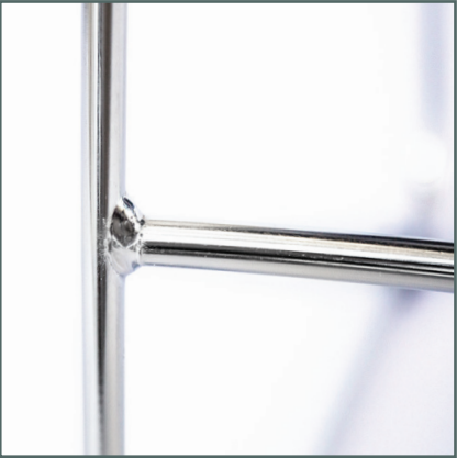
Lightweight, yet durable, chrome-plated steel frame