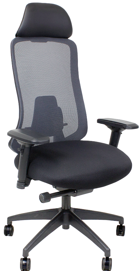
WITH HEADREST Item #682201