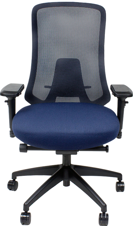
WITHOUT HEADREST Item #682200