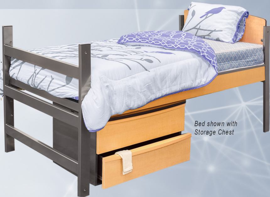
Bed shown with Storage Chest