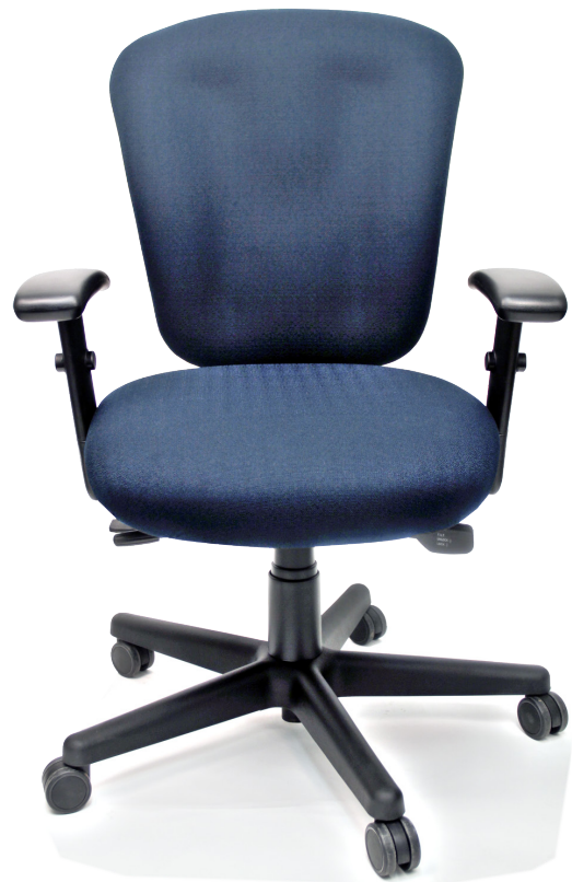
Manhattan Petite ergonomic Chair Style 682800