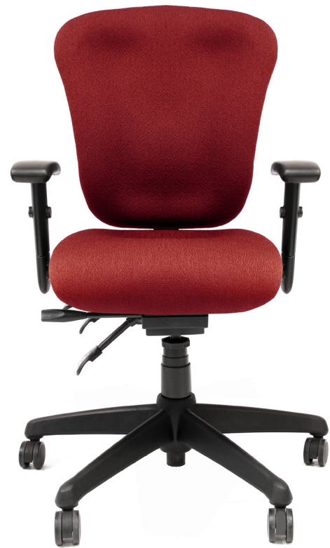
Manhattan ergonomic Chair Style 682500