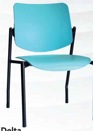
Delta black frame, aqua polypropylene, armless, glides