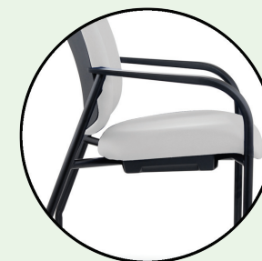
Steel Frame A steel frame in black or silver powder coat is strong, durable, sleek, easy to clean and scratch resistant.