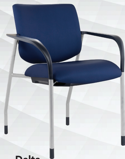
Delta silver frame, fabric, arms, glides