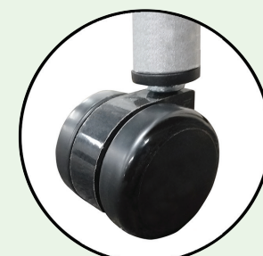
Chair Casters Add optional chair casters for mobility

Brochure may not represent actual fabric colors.