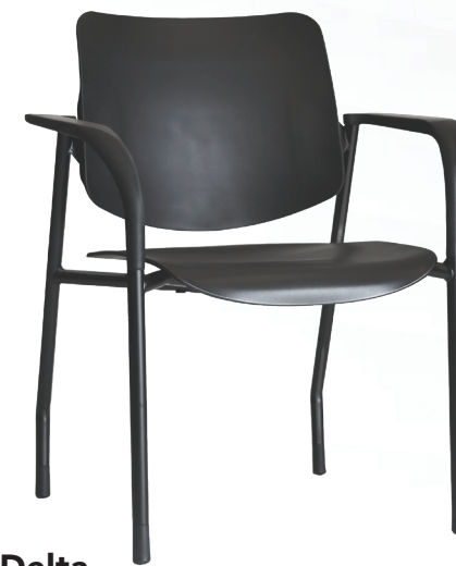
Delta black frame, black polypropylene, arms, glides