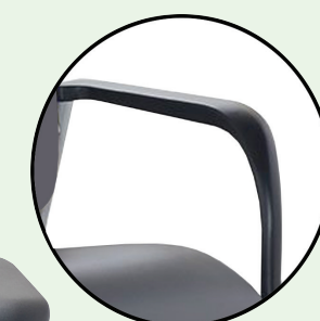
Armrests Supportive arm rests add comfort and style as an option