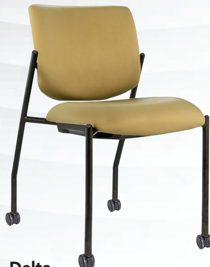
Delta black frame, fabric, armless, casters