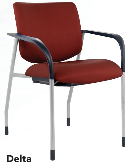
Delta silver frame, fabric, arms, glides