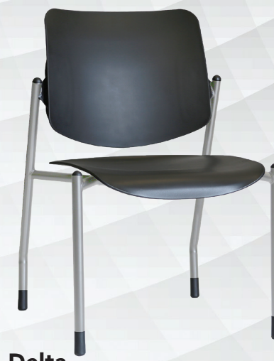
Delta silver frame, black polypropylene, armless, glides