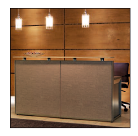
Reception Application of Legion include elevated transaction counters with plenty of concealed storage.