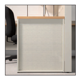
Perforated Insert - give worksurface-supporting legs a uniform look and help users maintain their modesty.

In individual stations, storage space is often at a premium. Legion helps maximize it by integrating seamlessly with U-Series, Venus, and Universal overhead cabinets. Exemplifying the furniture's openness and minimalism, U-Series cabinets offer a unique sliding-door design that provides access to materials without encroaching on the user's space. The sliding doors also make U-Series storage ideal for applications beneath the worksurface like credenzas and underheads.