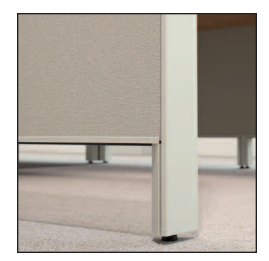
Raised Panel Leg - set Legion Panel Systems apart by improving air circulation in the workspace.