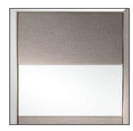
Markerboard Panels are made of steel, making them compatible with both magnets and markers.