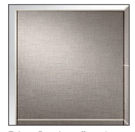
Fabric Panels - offer privacy and acoustic dampening to improve concentration in collaborative spaces.