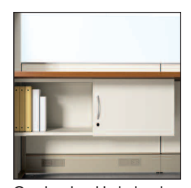
Overhead or Underhead Storage - is provided by U-Series cabinets with their unique sliding door.