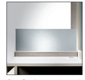
Glass Dividers - can be used at worksurface or standing height to let in natural light while defining spaces.