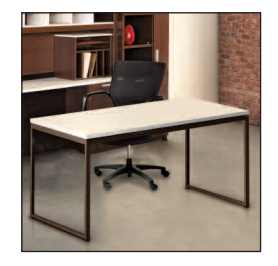
Freestanding Table translates the line's open leg and slim profile into an eye-catching centerpiece for consultations.