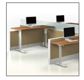
Panel Wrapped Tables give users the best of both worlds—privacy and heightadjustable surfaces.