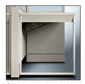
Open Leg - makes a bold visual statement in a minimal footprint when supporting a worksurface.

With the Legion panel system, we give you a diverse group of specialized components ready for the field. All that's left to decide is where you want them to take you first.